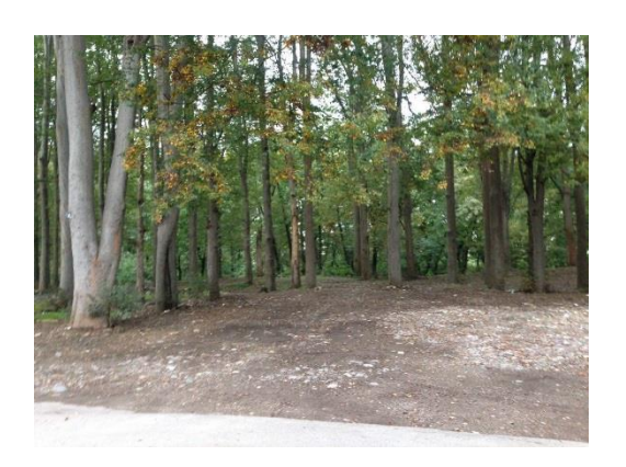
Fig: 3. The desired site for designing