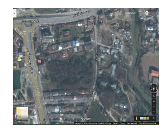
Fig: 1. location of site

Hence, regarding to the points mentioned, briefly, the main features of the site and the reasons of selecting it for designing the touristic-entertainment can be summarized in the following cases: