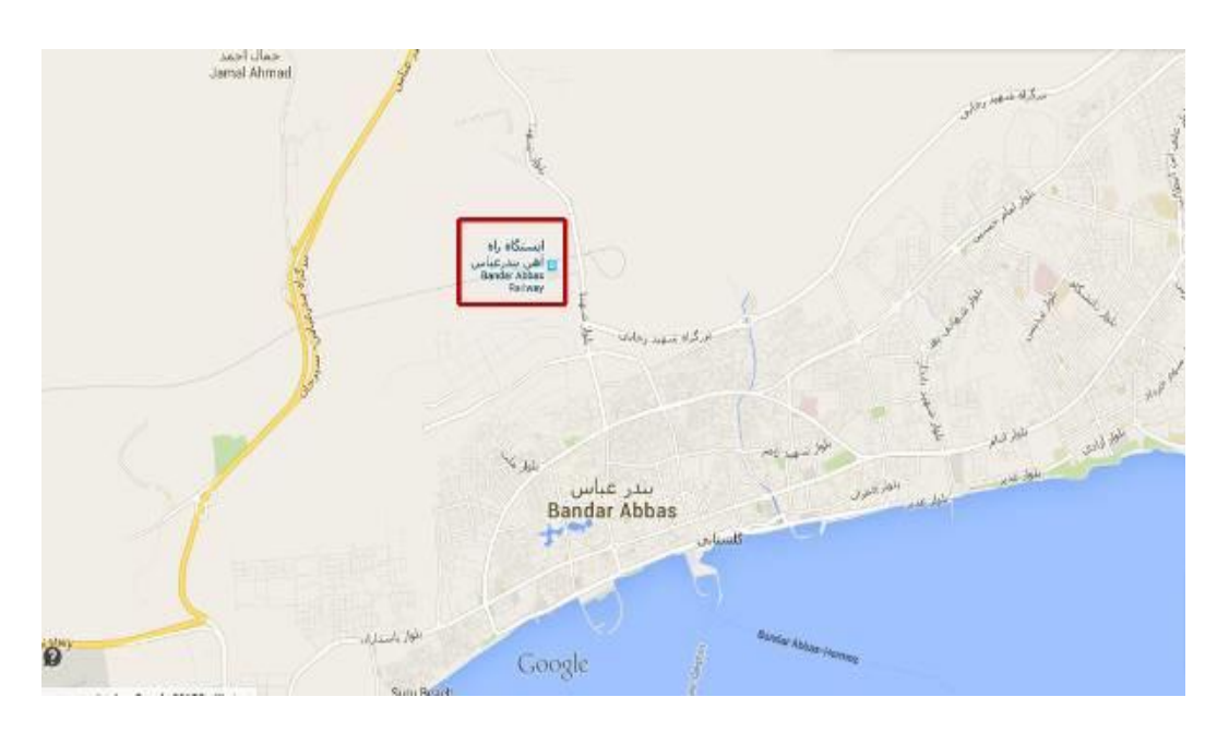
Fig. 1: Map location of Bandar Abbas railway station