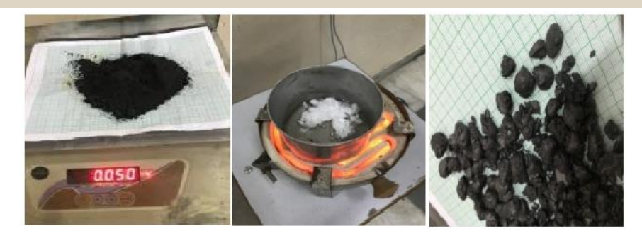
Fig. 1: PCM Preparation paraffin wax and graphite powder