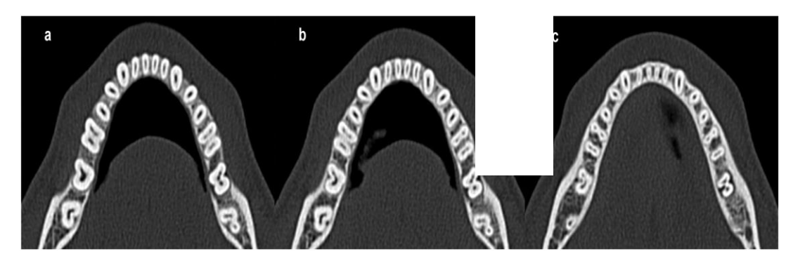
Fig: 5. CT image of C-shaped canal at various levels: (a) Coronal 3rd, (b) Middle 3rd, (c) Apical 3rd

Recent research used a spiral computed tomography [Figure-6] scan to diagnose the canal anatomy, but the dissolution of the image is not yet high enough to show irregular or fine canal structures.