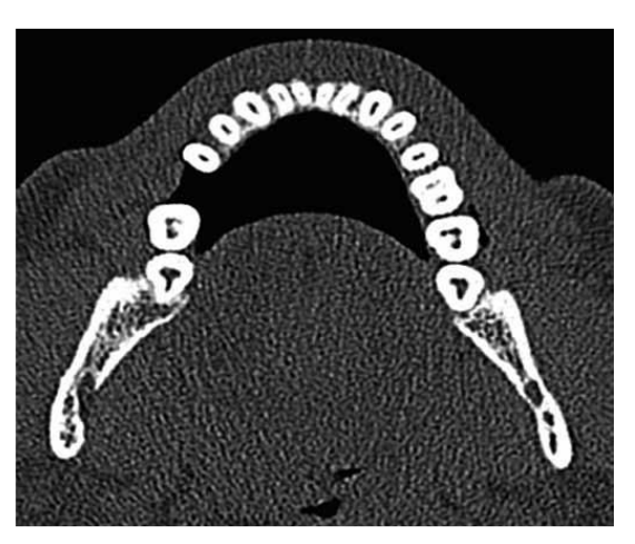
Fig: 6. CBCT image of C-shaped canal system in both mandibular left and right molar teeth

preoperative radiographs [12]. Conversely, some investigators described four radiographic characteristics that can allow prediction of the existence of this anatomical condition: radicular fusion, radicular proximity, a large distal canal or a blurred image of a third canal in between. Hence, a C-shaped root in a mandibular second molar may present radiographically as a single-fused root or as two distinct roots with a communication [13-14]. When the communication or fin connecting the two roots is very thin, it is not visible on the radiograph and may thus give the appearance of two distinct roots. The radiograph may also reveal a large and deep pulp chamber, usually found in C-shaped molars.