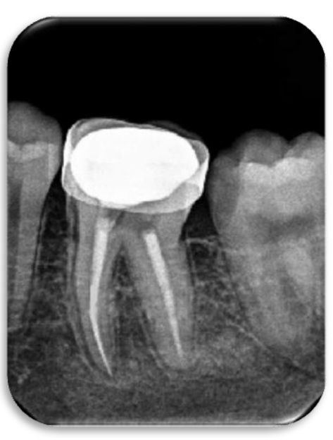
Fig: 5. 10 month follow up Radiograph

A follow-up done at the end of 10 months showed satisfactory healing, suggesting the successful outcome of the treatment in saving the fractured tooth segment [figure-5].