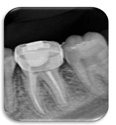
Fig: 3. Immediate post obturation radiograph

After performing the standard adhesive technique [acid etching carried out using 37% phosphoric acid (Etching gel, Prime Dental Products, Mumbai, India) followed by bonding using 5<sup>th</sup> gen single bottle adhesive system Tetric Bond (Ivoclar Vivadent Schaan, Principality of Liechtenstein)], the cavity surfaces were coated with a layer of low-viscosity resin composite (Protect Liner F, Kuraray, Japan). Curing was done using a combination of pulse and progressive curing technique. Restoration was done incrementally with fibre reinforced composite (everX Posterior GC, India) composite core and an onlay of nanofilled composite resin (Solare X, GC, India) [ Figure-4 ]. Orthodontic band was removed using band removing plier (Eltee, Libral traders, New Delhi ). A full coverage crown was given after the post endodontic restoration [ Figure-4 ].