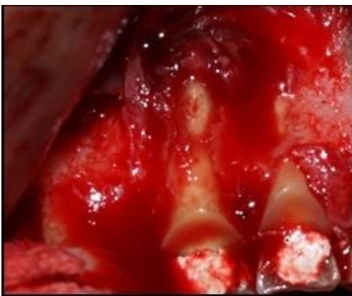
Fig: 2. Presence of dehiscence

The surgical procedure was explained to the patient and the informed consent was taken. Bilateral infraorbital and nasopalatine nerve block was given with lignocaine with 1:80,000 adrenaline (BiochemPharma, Mumbai) and a full thickness mucoperiosteal flap was raised from 11 (Upper Maxillary Right Central Incisor) to 23 (Upper Maxillary Left Canine). On flap reflection the cystic lesion was evident at the apical end of 21 along with dehiscence along the length of the root [Figure- 2]. Cystic enucleation was done in toto by packing wet gauze to separate the cyst from the bone [Figure-3]. However due to absence of buccal bone support and due to tight adherence of cystic lining on the lingual aspect, enucleation led to exfoliation of 21 in the process [Figure- 4]. The exfoliated tooth was held in gauze soaked in normal saline. The apicoectomy was done with ultrasonic tips (Vista Dental Products, USA) and the cavity filled with MTA (MTA Angelus, Brasil). This was followed by its replacement in the socket. The cystic cavity was filled with Bio-Oss bone graft material (Geistlich Bio-Oss, North America [Figure- 5] and flap was closed with interrupted sutures. In order to ensure stability of 21 during healing and bone formation, splinting was done using fibre splint (Ribbond THM, Ribbond Inc., Seattle, WA, USA) which was placed on the buccal aspect from 11 to 23 for 2 weeks [Figure- 6].