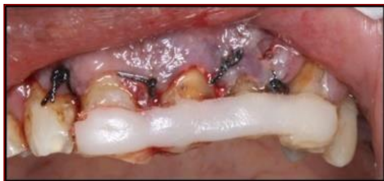
Fig: 6. Placement of Sutures and Splint

Sutures were removed after one week. Examination of 21 after removal of splint post 2 weeks revealed no presence of mobility. Follow up of the case after 6 months showed satisfactory healing of the lesion with no signs of mobility with 21 [Figure- 7].