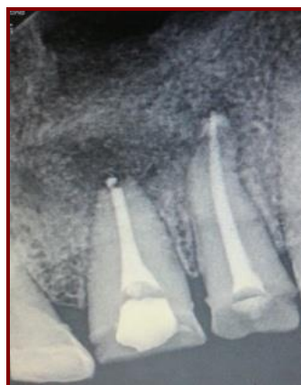
Fig: 7. Follow-Up after 6 Months

Sutures were removed after one week. Examination of 21 after removal of splint post 2 weeks revealed no presence of mobility. Follow up of the case after 6 months showed satisfactory healing of the lesion with no signs of mobility with 21 [Figure- 7].