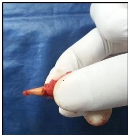
Fig: 4. Exfoliation of 21