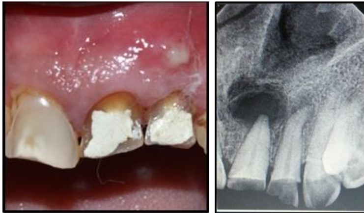
Fig: 1(a). Presence of Sinus. (b) Radiograph Showing Large Periapical Lesion

The surgical procedure was explained to the patient and the informed consent was taken. Bilateral infraorbital and nasopalatine nerve block was given with lignocaine with 1:80,000 adrenaline (BiochemPharma, Mumbai) and a full thickness mucoperiosteal flap was raised from 11 (Upper Maxillary Right Central Incisor) to 23 (Upper Maxillary Left Canine). On flap reflection the cystic lesion was evident at the apical end of 21 along with dehiscence along the length of the root [Figure- 2]. Cystic enucleation was done in toto by packing wet gauze to separate the cyst from the bone [Figure-3]. However due to absence of buccal bone support and due to tight adherence of cystic lining on the lingual aspect, enucleation led to exfoliation of 21 in the process [Figure- 4]. The exfoliated tooth was held in gauze soaked in normal saline. The apicoectomy was done with ultrasonic tips (Vista Dental Products, USA) and the cavity filled with MTA (MTA Angelus, Brasil). This was followed by its replacement in the socket. The cystic cavity was filled with Bio-Oss bone graft material (Geistlich Bio-Oss, North America [Figure- 5] and flap was closed with interrupted sutures. In order to ensure stability of 21 during healing and bone formation, splinting was done using fibre splint (Ribbond THM, Ribbond Inc., Seattle, WA, USA) which was placed on the buccal aspect from 11 to 23 for 2 weeks [Figure- 6].