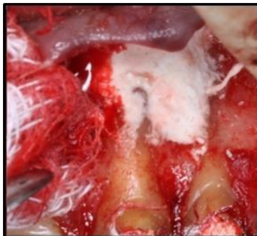
Fig: 5. Placement of Bone Graft