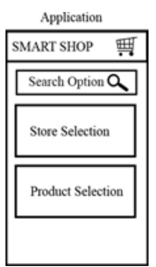
Fig: 5. Basic template of an application.