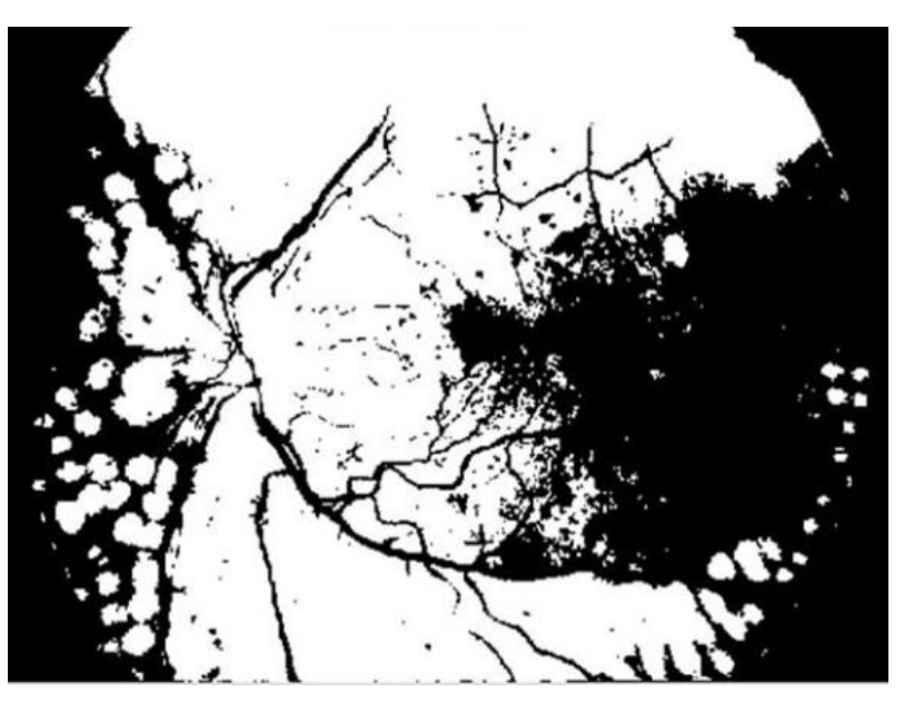
Fig: 3. Vessel detection from spatial weighted Fuzzy c-Means clustering algorithm.

Early diagnosis of diabetic retinopathy was suggested based on decision support system by Kahai et al. [25]. Normal and prolific diabetic retinopathy phases were automatically classified with the help of dimensions of the RGB components of the blood vessels coupled with a neural network technique. Nayak et al. [26] have investigated exudates and blood vessel area along with texture parameters together with neural network to classify fundus images into normal and diabetic retinopathy. Recently, Acharya et al. [27] used support vector machine (SVM) classifier to categorize the fundus image into normal and prolific diabetic retinopathy phases. They have established an average accuracy of 82%. Larsen et al. [28] have developed an automated system, which identified around 90% of patients with diabetic retinopathy and around 82% of patients without diabetic retinopathy, when implemented in a screening population involving of patients with untreated diabetic retinopathy.