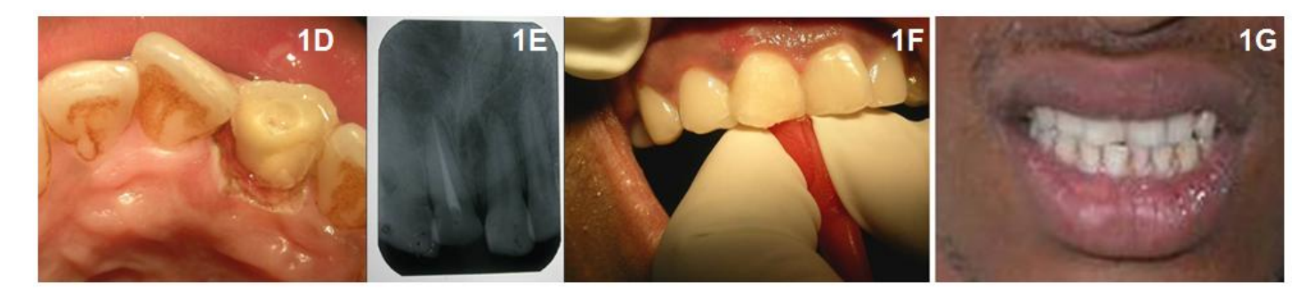
Fig: 1. D) Electrocautery done, E) Post-obturation radiograph, F) Reattachment, G) 1 year follow-up photograph