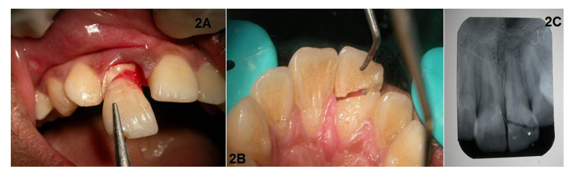
Fig: 2. A) Preoperative labial view, B) Preoperative palatal view, C) Preoperative radiograph

Radiographic examination (I.O.P.A.) revealed complete root formation and coronal fracture but no extrusion of the root was seen [Figure- 2C] Reattachment as an option was discussed with the patient and his consent was obtained.