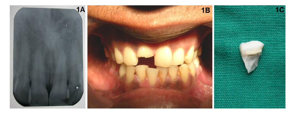
Fig: 1. A) Pre-operative radiograph, B) Pre-operative Photograph after removal of fractured segment, C) Fractured segment

On recall visit after a month, clinical examination revealed complete healing of the palatal gingival surgical wound and upon recall after 12 months a stable reattachment was observed, with good esthetics and periodontal health [Figure-1G].