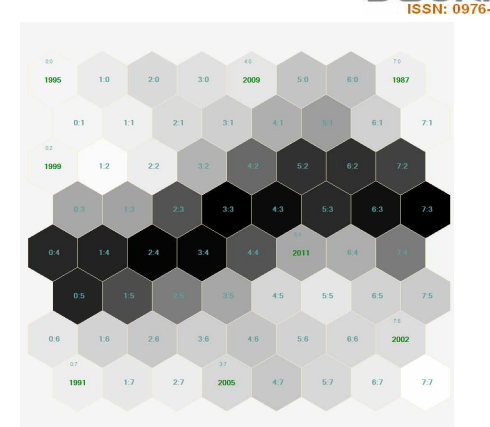
Fig: 3. Elections in Portugal organized by the SOM

The electoral cycle literature has developed in two clearly distinct phases. The first one, which took place in the mid-1970s, considered the existence of non-rational (naive) voters. In accordance with the rational expectations revolution, in the late 1980s the second phase of models considered fully rational voters. In any of these two phases a distinction between the political and the partisan versions was also made. In accordance to the political version the ideological aspects are not important whereas in the partisan version the ideology of the incumbent is indeed relevant. From this point of view, it is accepted that the evolution of the economy and the consequent election results will be different depending on the type (left-right; conservative-liberal) of the incumbent.